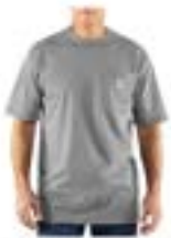
DE Carhartt FR Force SS T-shirt

PORTALS CAN BE DESIGNED TO ACCOMMODATE DIFFERENT METHODS FOR PURCHASING AND PAYMENT OPTIONS TO MEET YOUR NEEDS.