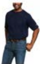
DE Ariat FR SS Crew T-shirt