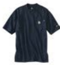
DE Carhartt FR Force SS T-shirt