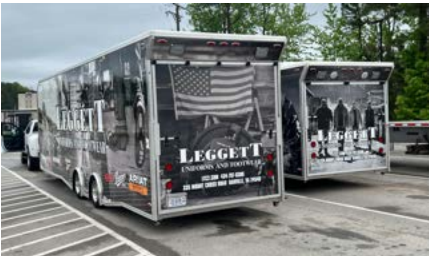
We now have two custom trailers to provide mobile shopping options to local factories and crews.

WE ACCEPT ALL CREDIT CARDS, CASH, COMPANY ISSUED VOUCHERS AND PAYROLL DEDUCTION THROUGH OUR MOBILE UNITS.