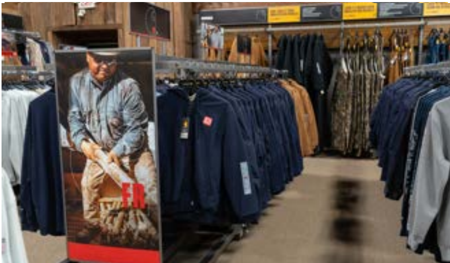
Our FR department has grown substantially over the last few years to meet our customers' needs.

WE STRIVE TO PROVIDE THE BEST APPAREL OPTIONS WITH COMPETITIVE PRICING TO MEET YOUR BUDGET.